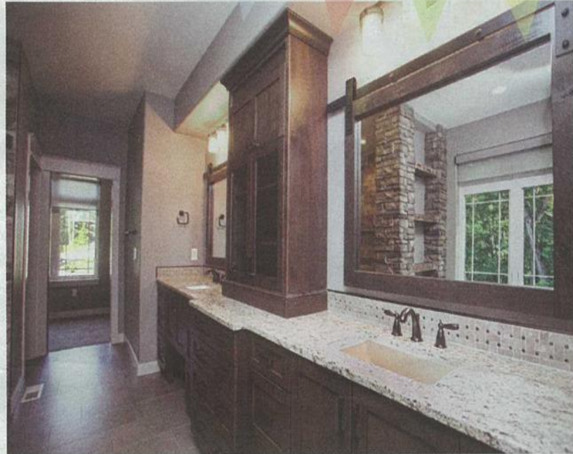
The master bathroom at 30 Park Place, Tiffin, features a double sink area with granite countertops. The reflection in the mirror shows the windows above the bathtub. At the end of the bathroom is a full-size closet.

Located on a cul-de-sac and nestled in the woods, the 6,114-square-foot, five-bedroom home features a concrete deck off the main floor, a large concrete patio off the walkout lower level, a master suite on the main floor and a bonus room above the garage.